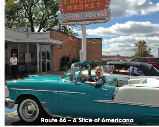
Route 66 – A Slice of Americana

No place in the United States offers you quite the slice of Americana as the Midwest. Just 20 miles (32 kilometers) west of Chicago, DuPage County is one of the wealthiest, healthiest, and greenest counties in Illinois – offering a unique combination of sophistication and local charm. Consisting of 38 vibrant communities, where the steaks are hearty, the craft beers are locally brewed, and the people are warm and hospitable – DuPage County attracts both the business and leisure traveler. Be prepared to experience world-class dining, high-end shopping and historical attractions.