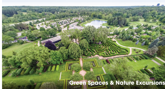
Green Spaces & Nature Excursions