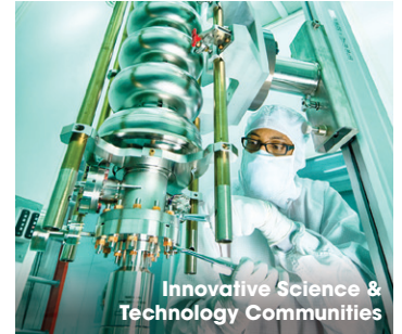
Innovative Science & Technology Communities