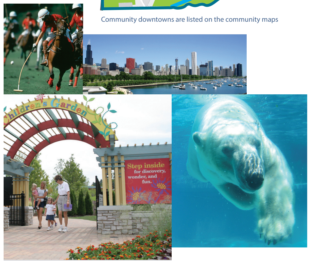
Community downtowns are listed on the community maps